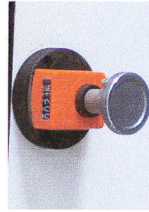
Motorized Back-gauge with manual fine adjustment & analogue counter