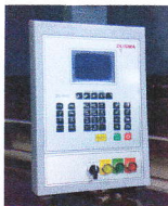
Control Panel DU 6000