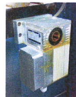
Auto Crowning (Long machines)